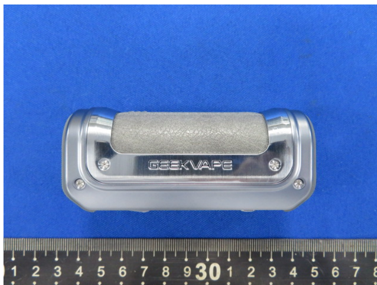
Geekvape Max100 Mod with 0.2ohm/ 0.25ohm